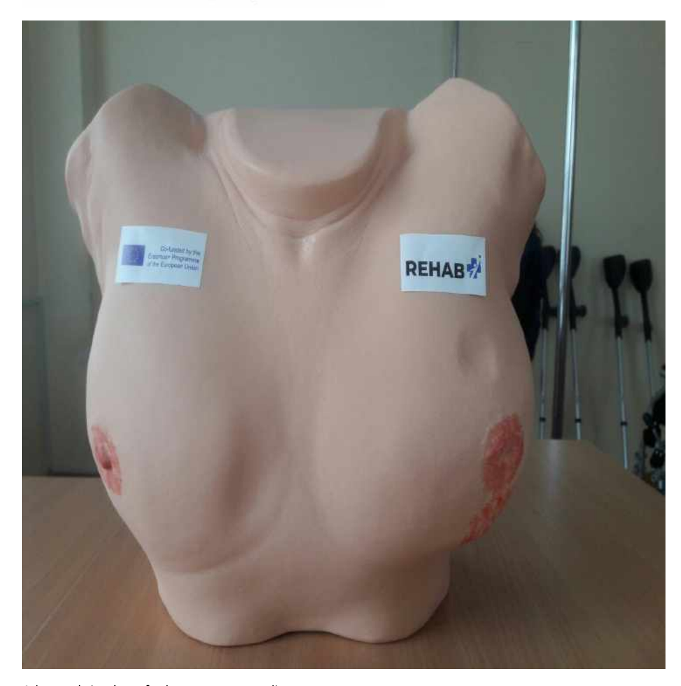
Advanced simulator for breast exam studies