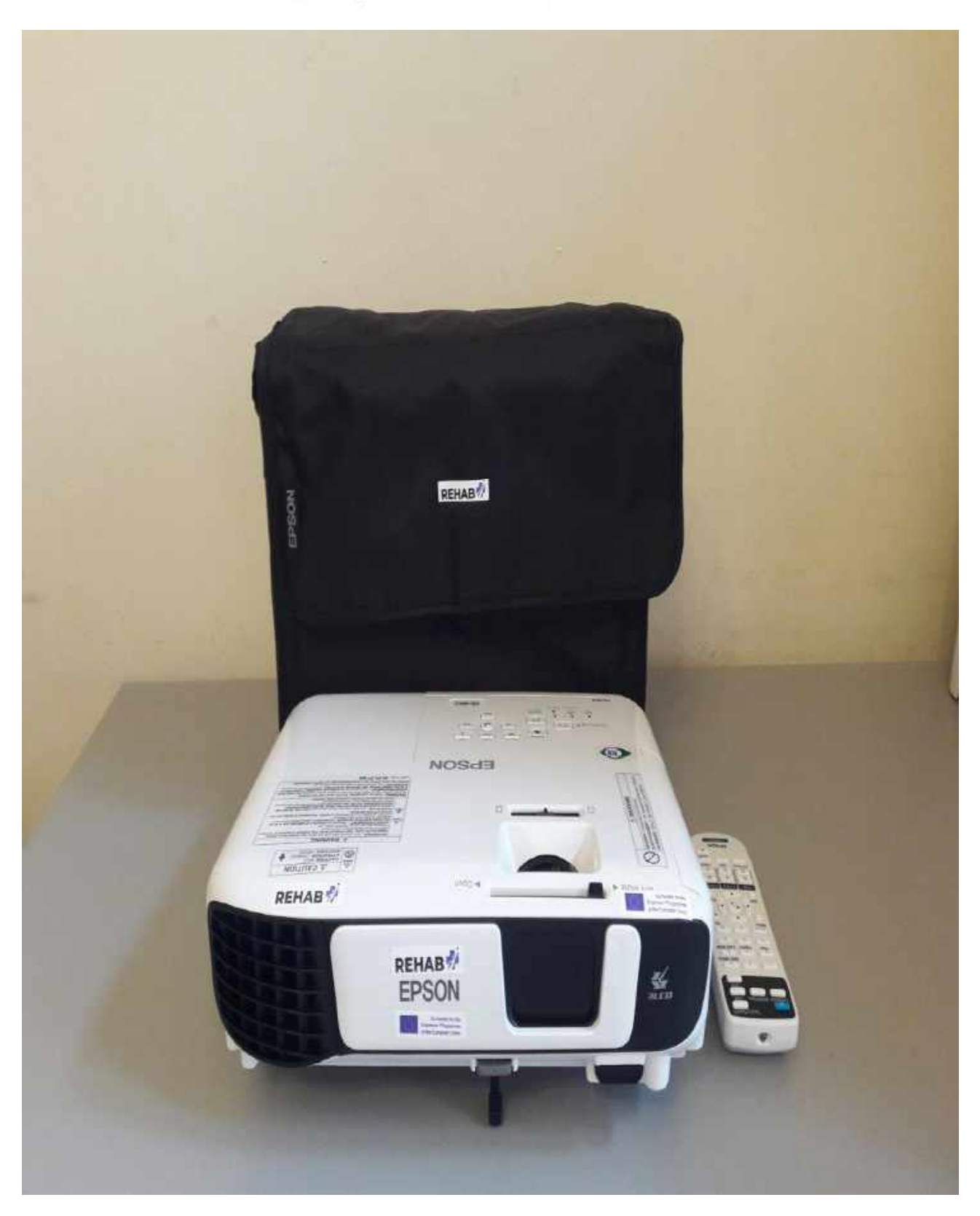
Projector (WXGA, 3600 lm, Wi-Fi)