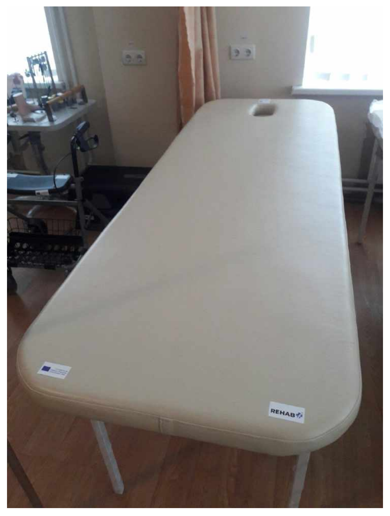
Couch medical review KMo-1 (color gray)