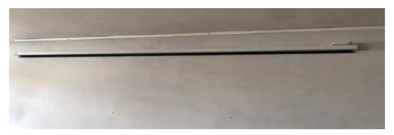
Projector screen 200"